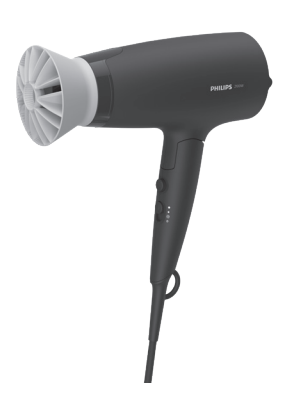
Register your product and get support at www.philips.com/welcome