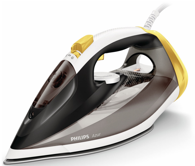
Philips Azur Steam iron

45g/min continuous steam 200g steam boost SteamGlide soleplate