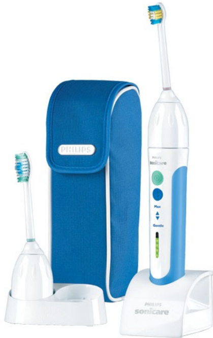
Philips Sonicare Elite Sonic electric toothbrush