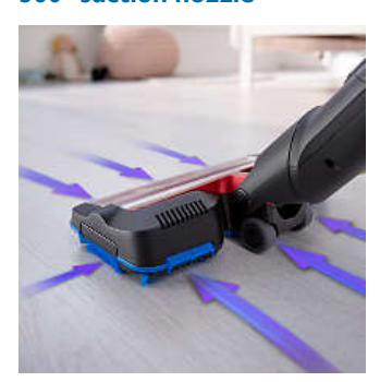
360° suction nozzle captures dust and dirt faster