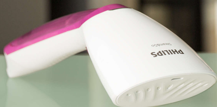
Philips Steam&Go Handheld garment steamer

1000W, up to 20 g/min Vertical Steaming 70ml Detachable water tank