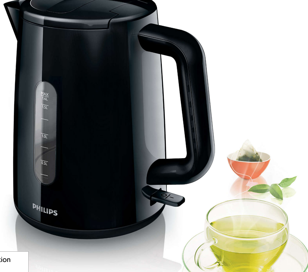
Philips Daily Collection Kettle