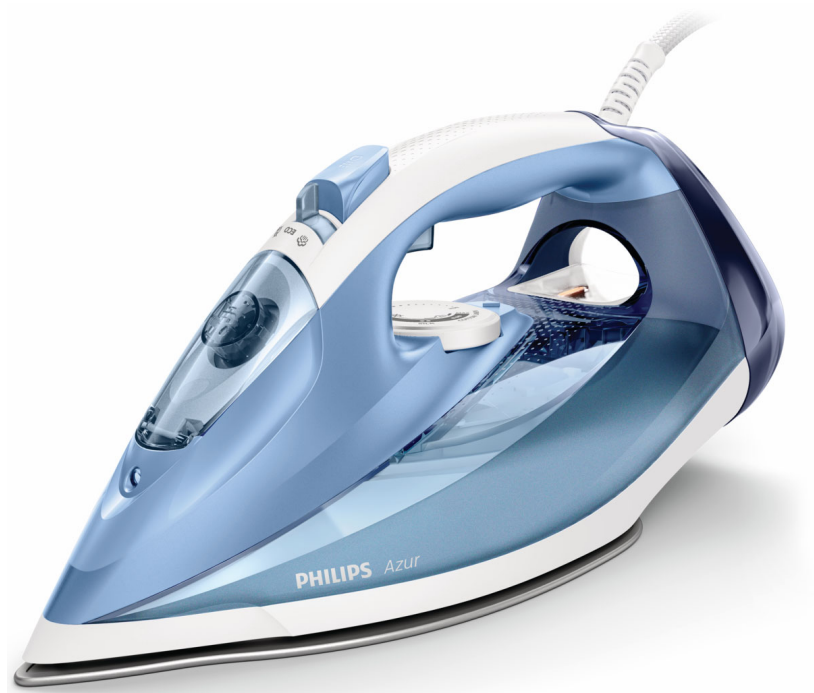
Philips Azur Steam iron

45g/min continuous steam 180g steam boost SteamGlide soleplate