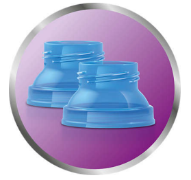
Pump in storage containers

With the milk storage cup adapter, you can easily pump in the milk storage container. No leakage, no spillage of your precious breast milk.