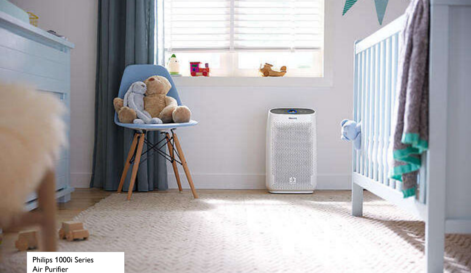
Philips 1000i Series Air Purifier

Purifies rooms up to 63 m 2 270 m 3 /h clean air rate (CADR) HEPA & Active Carbon filter