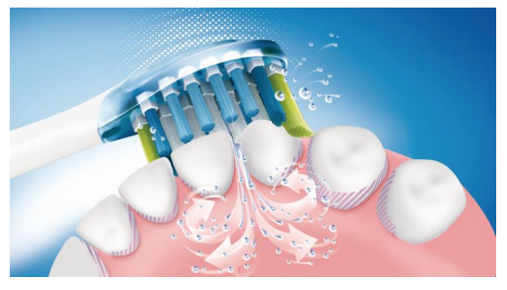
Drives fluid between the teeth and along the gumline for a powerful yet gentle clean.