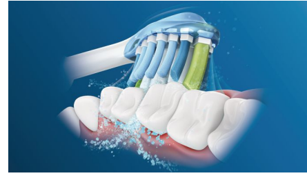
Philips Sonicare's advanced sonic technology pulses water between teeth, and its brush strokes break up plaque and sweep it away for an exceptional daily clean.