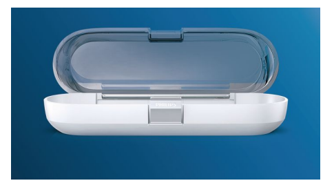
Designed to fit your lifestyle

Our premium travel case lets you store your toothbrush hygienically, while our compact travel charger keeps you topped up when you're on the go. You'll enjoy two weeks of regular use from a single full charge, so being on the move means you needn't miss out on that fresh feeling.