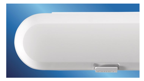
It's easy to take your FlexCare Platinum wherever you need it with an easy-to-pack travel case and compact travel charger.