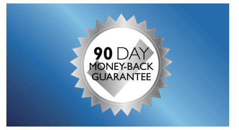
This Philips Sonicare electric toothbrush comes with a money-back guarantee. Use it for 90 days and if you are not 100% satisfied for any reason, we'll give you a full refund.