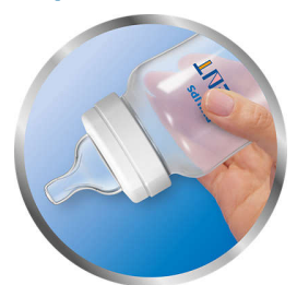
Easy to hold

Due to the unique shape, the feeding bottle is easy to hold and grip in any direction for maximum comfort, even for baby's tiny hands.