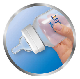
Easy to hold

The unique bottle shape makes this bottle easy to hold and grip in any direction.