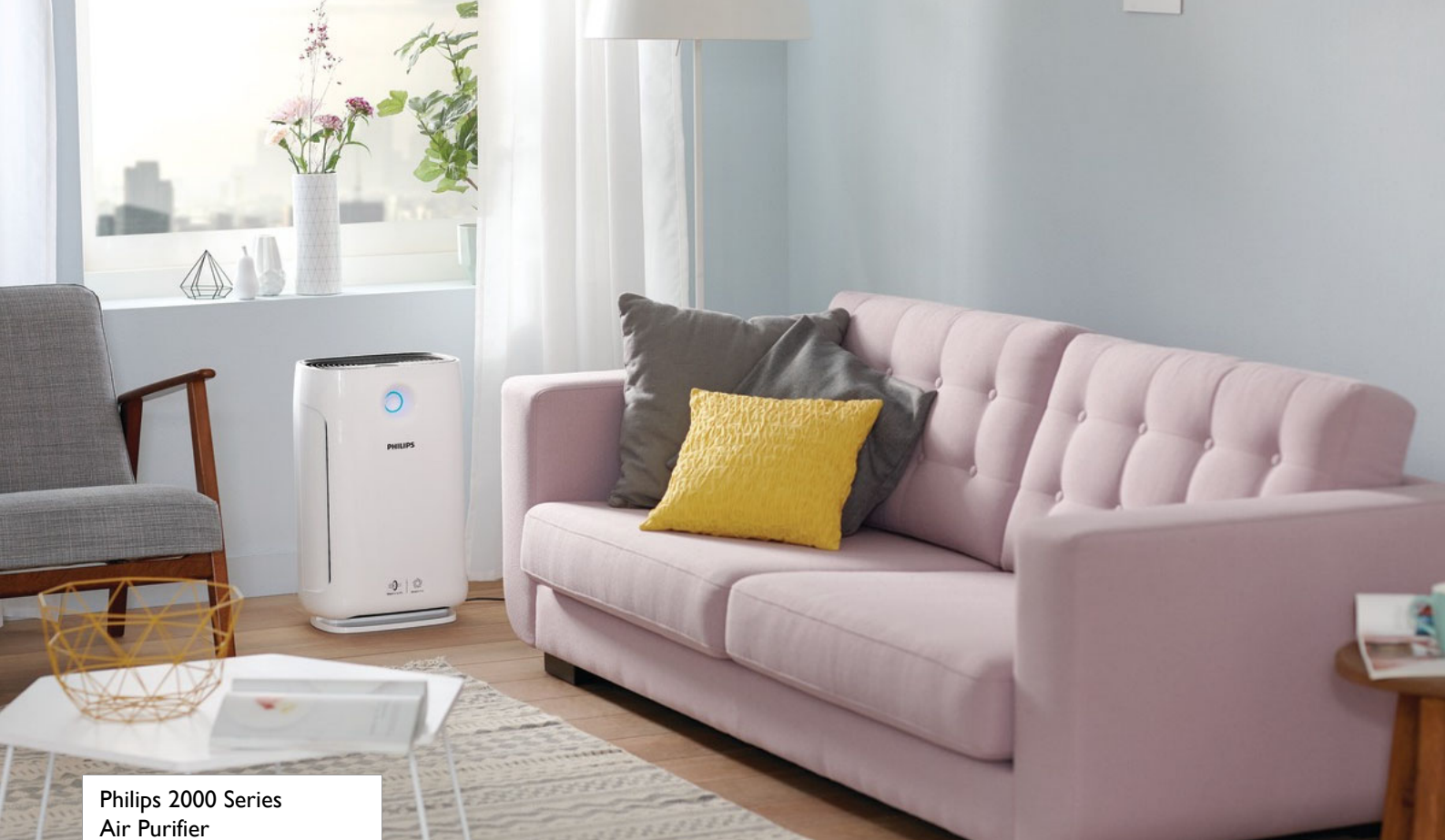
Philips 2000 Series Air Purifier

Purifies rooms up to 79 m 2 333 m 3 /h clean air rate (CADR) HEPA & Active Carbon filter