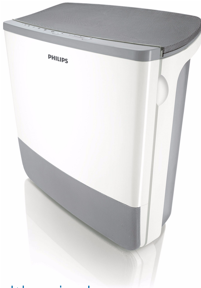
Philips living room air purifier