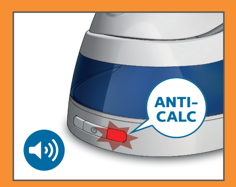
Replace the ANTI-CALC cartridge once the descaling light flashes and the appliance beeps.