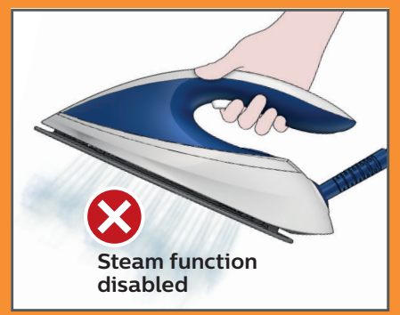
The steam function will be disabled automatically if the ANTI-CALC cartridge is not replaced.