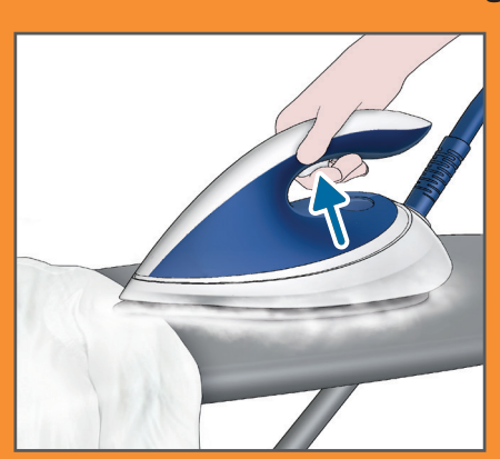
Press and hold the steam trigger for steam during ironing.

Steam will enhance your ironing performance. Control the steam while ironing by using the steam trigger.