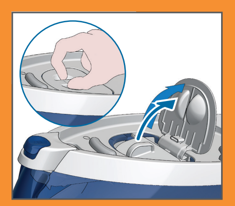
Remove the iron from the iron platform and open the ANTI-CALC cartridge compartment.