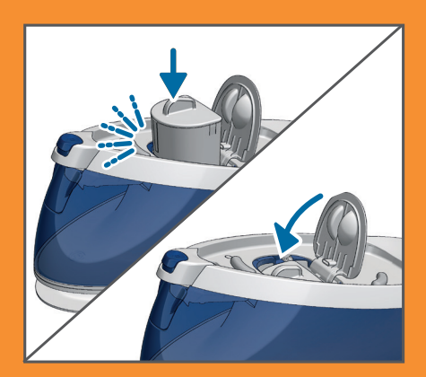
Press down the ANTI-CALC cartridge in the compartment until it locks into place and close the lid.