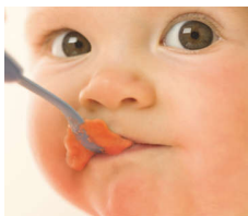
Recipe booklet Nutritious meals made easy