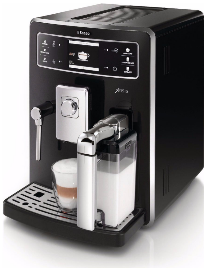
Saeco Xelsis Super-automatic espresso machine