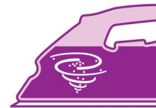
Double active calc

The calc-clean function enables you to simply flush your Philips iron to remove the calc particles from your iron. This will extend the lifetime of your iron.