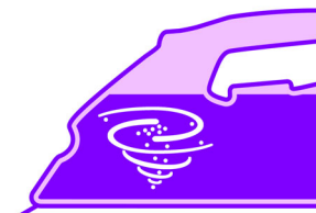
Double active calc

The calc clean function enables you to simply flush your Philips iron to remove the calc particles out of your iron. This will extend the lifetime of your iron.