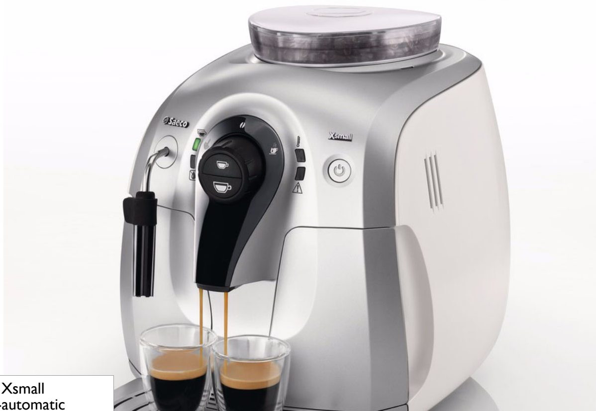
Saeco Xsmall Super-automatic espresso machine