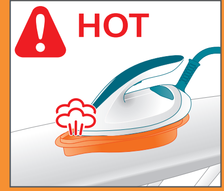
Wait approximately 5 minutes before emptying the Calc-Clean container.