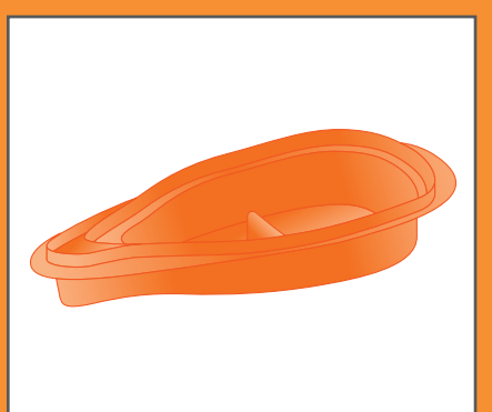
With the Calc-Clean container provided, you can perform descaling easily and get clean steam.

The steam function will be disabled automatically if descaling is not performed.