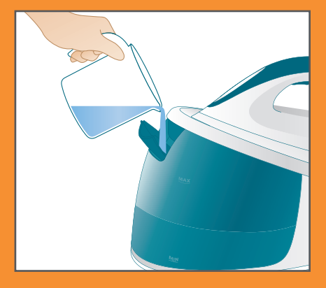
Fill the water tank halfway and switch on the appliance.