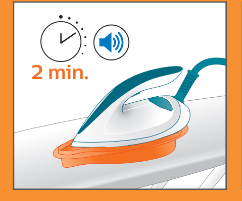
Wait approximately 2 minutes . You will hear short beeps.