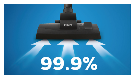
Multi-purpose nozzle and high suction power ensure you can vacuum 99.9% of fine dust*.