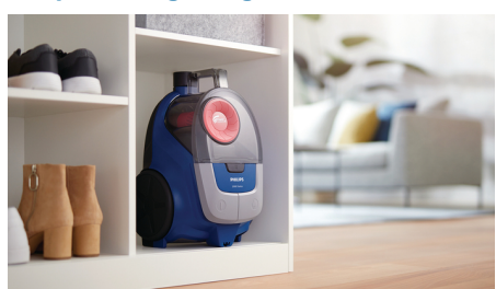
Compact and lightweight design ensure both storing and carrying the vacuum is easy.