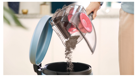
Easy-to-empty dust container is designed for hygienic disposal with one hand, to help minimize dust cloud.