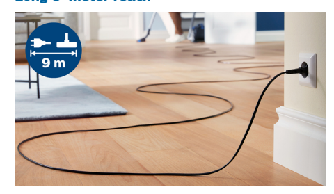
9-meter reach from plug to nozzle allows longer use without unplugging.