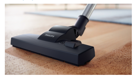
Multi-purpose nozzle can be easily adjusted using the foot pedal, for optimal use on hard floors or carpets.