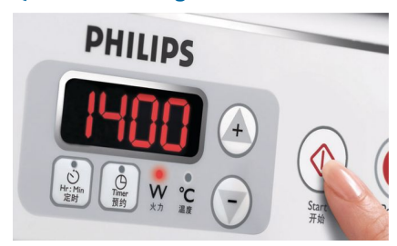
Simply press the start button then the appliance will cook at the default power