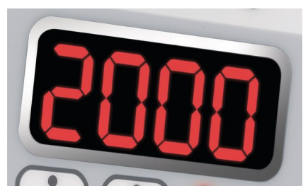
Shows power level and cooking time