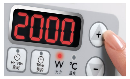
The maximum power output reaches 2000W during cooking