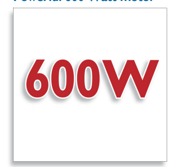
To blend food in seconds.