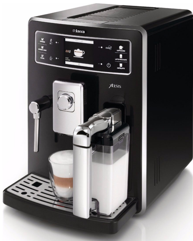
Saeco Xelsis Automatic espresso machine