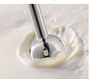
No splashes or mess while you blend.