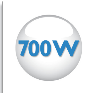
Powerful 700 W motor