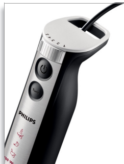
Multiple speeds and turbo button