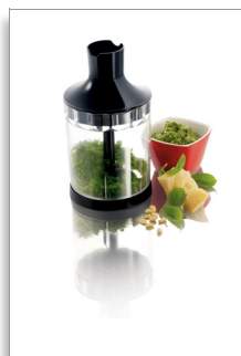
XL chopper accessory for chopping large quantities