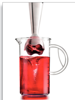
No splashes or mess while you blend.