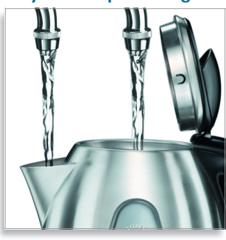
The kettle can be filled via the spout or by opening the lid.