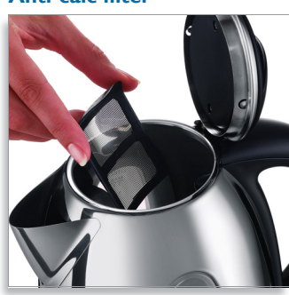
Anti-calc filter for a clean cup of water and a cleaner kettle.