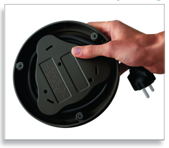
The cord can be wrapped around the base, so that the kettle is easy to place in your kitchen.