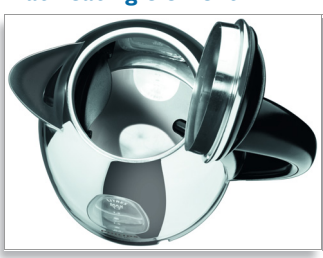
The stainless steel concealed element ensures fast boiling and easy cleaning.