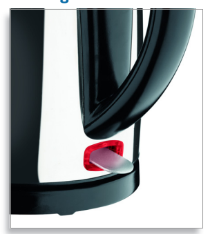
Elegant red light incorporated in the on/off switch indicates when the kettle is on.