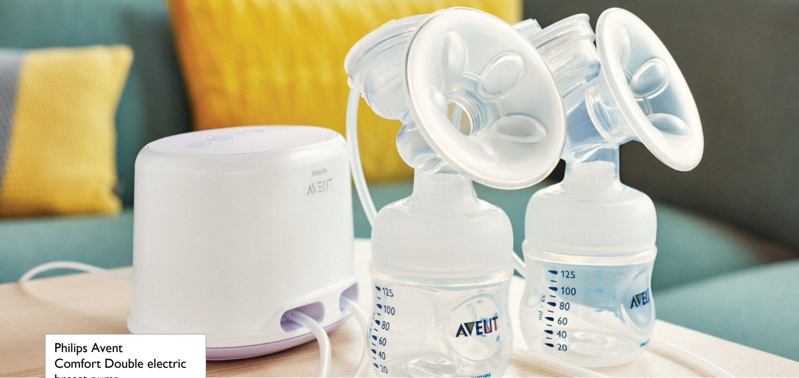
Philips Avent Comfort Double electric breast pump