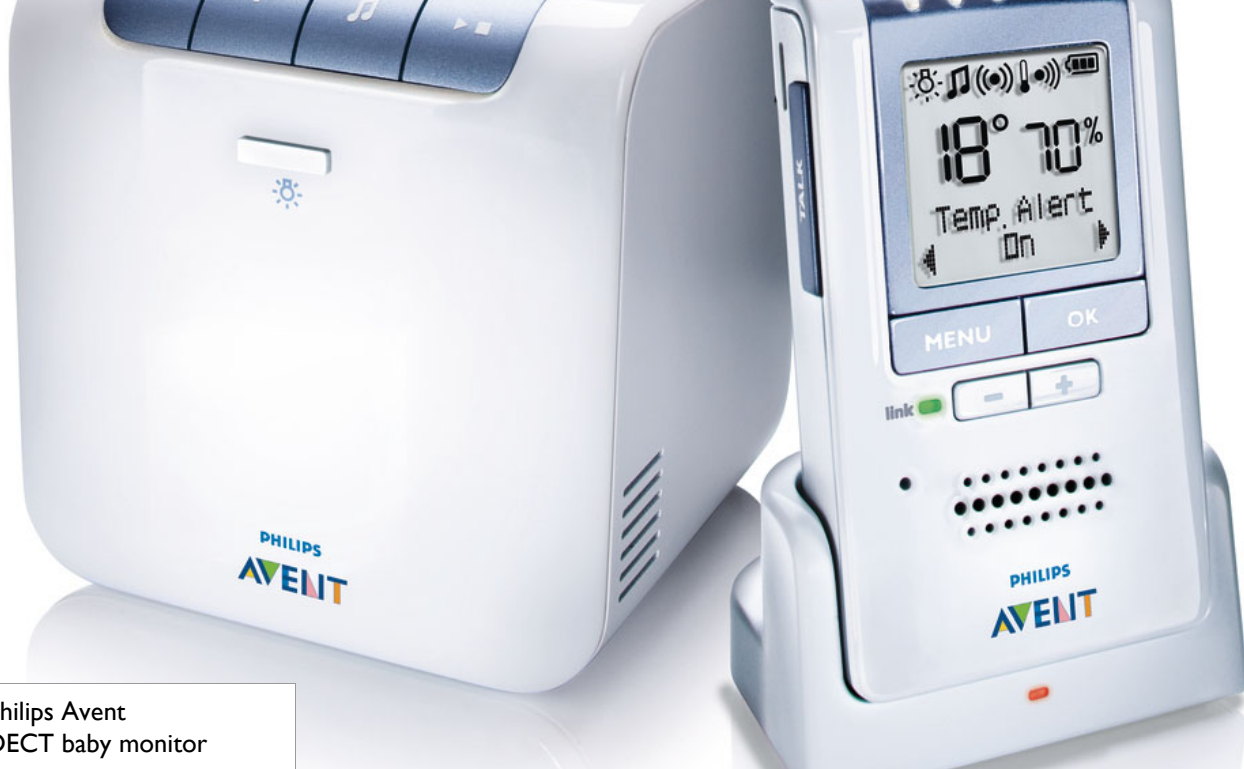
Philips Avent DECT baby monitor