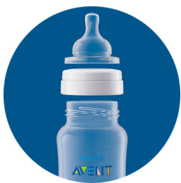
Easy to assemble

Our Anti-colic bottle has few parts for quick and simple assembly.