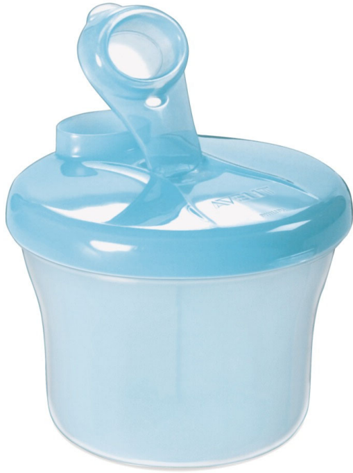
Philips Avent Milk powder dispenser