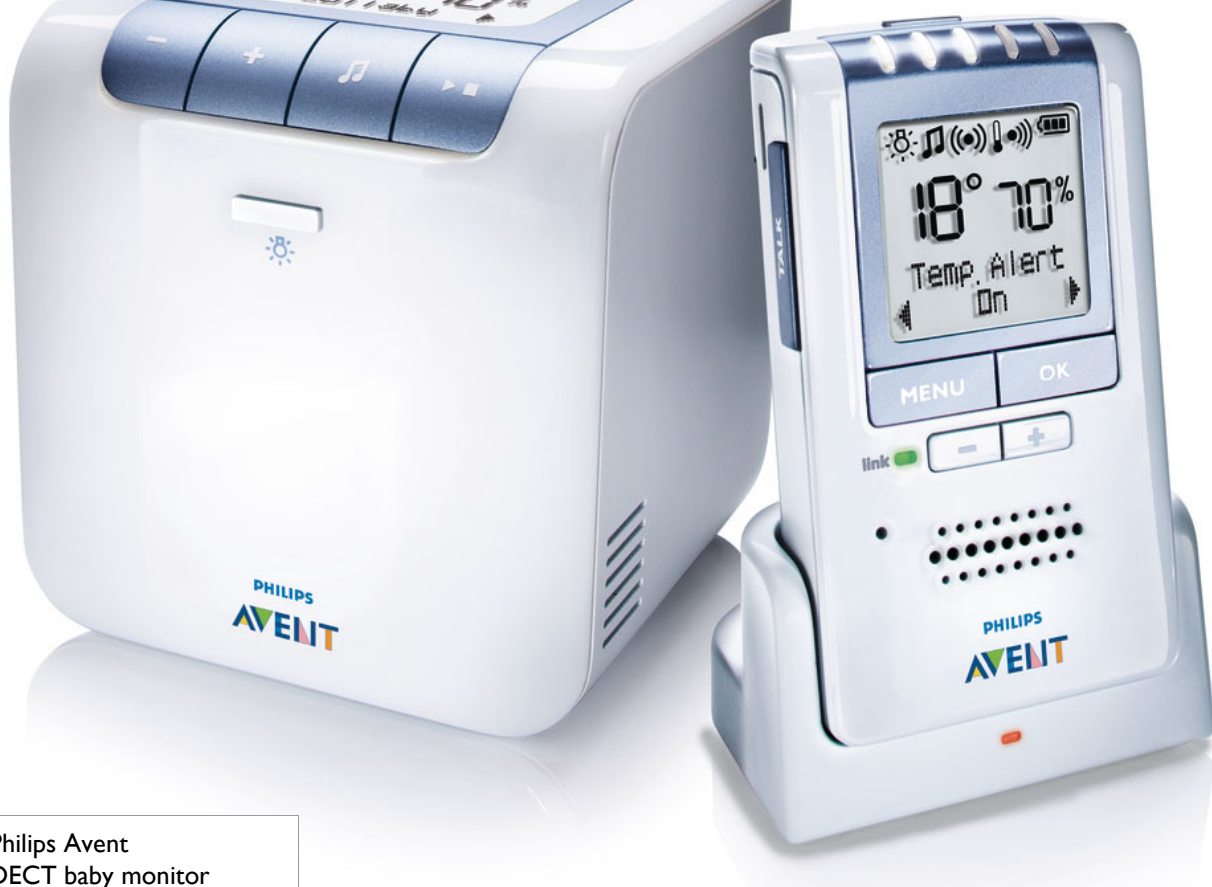
Philips Avent DECT baby monitor