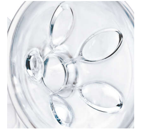
The unique active massage cushion is intended to help stimulate natural let-down