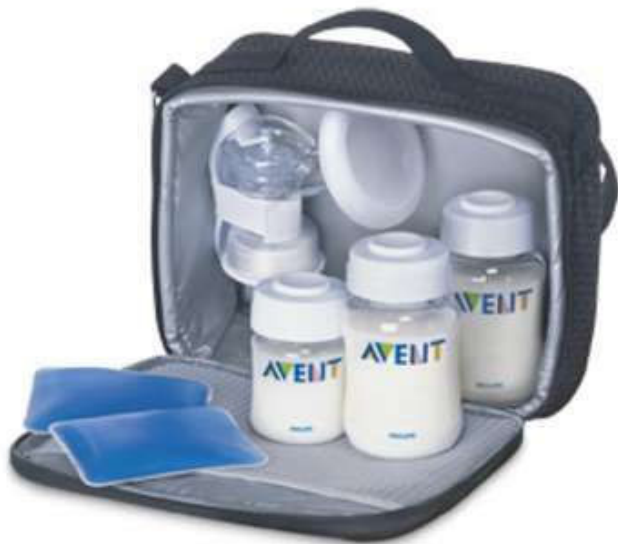
Philips Avent Manual breast pump