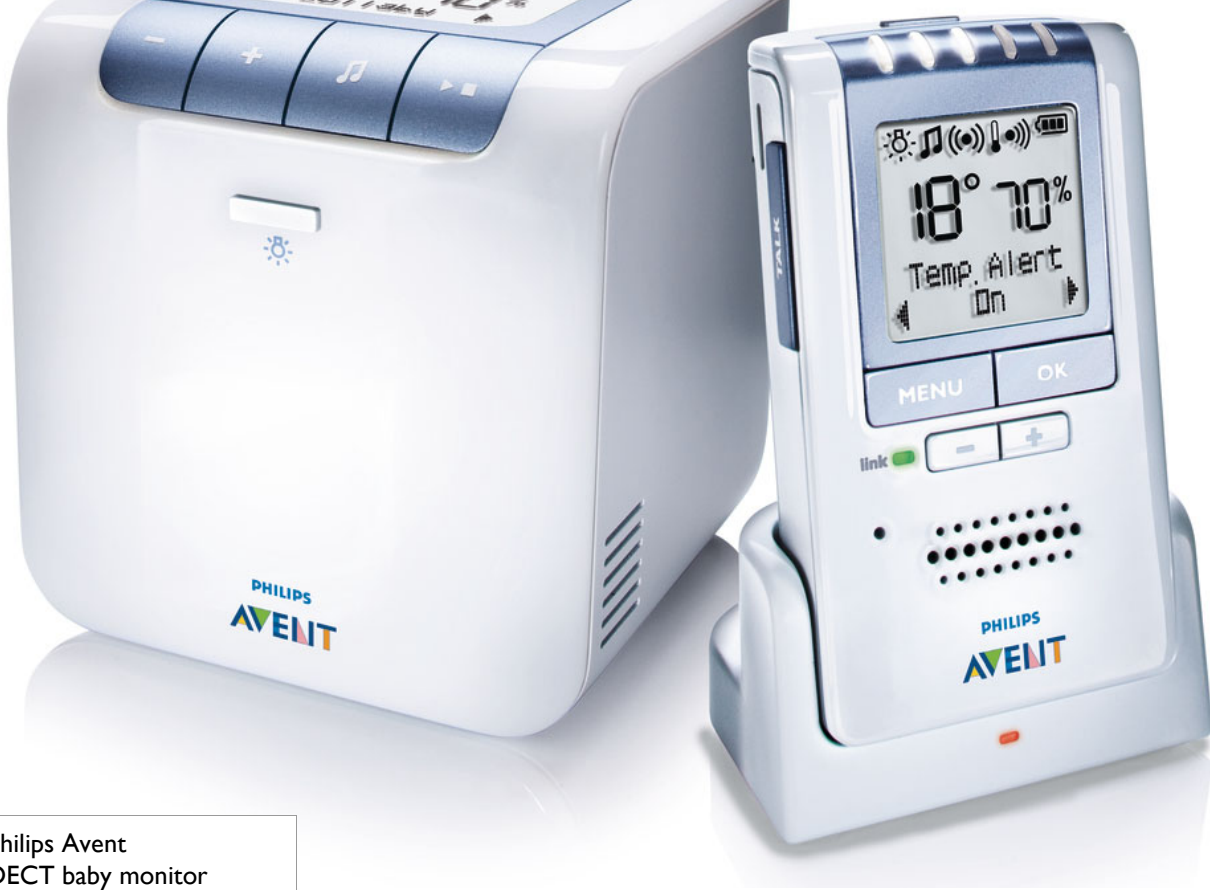
Philips Avent DECT baby monitor