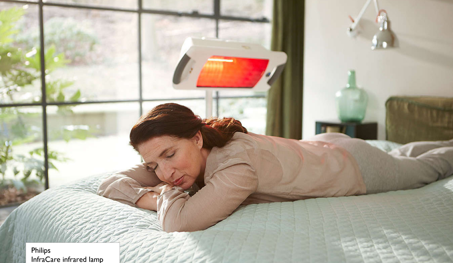
Philips InfraCare infrared lamp