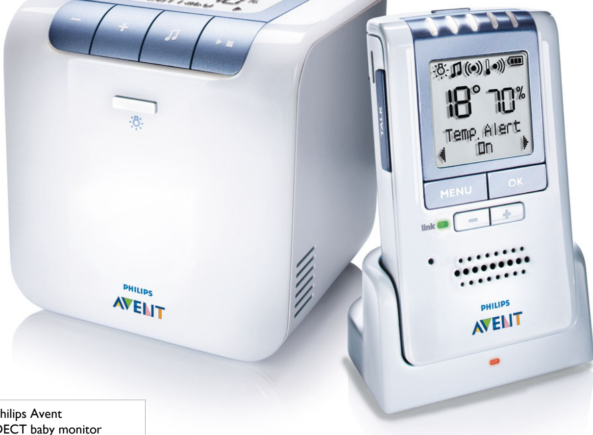
Philips Avent DECT baby monitor