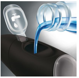
Fresh & clean with mouthwash

Fill the reservoir on the handle with either mouthwash or water, then point and press. Use with mouthwash for the ultimate fresh experience and anti-microbial benefits.