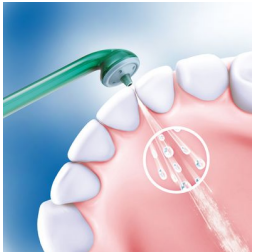
Air and micro-droplet technology