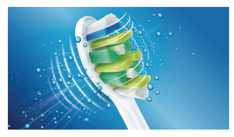
Extra-long, high-density bristles reach deeper between teeth to help remove significantly more plaque* interproximally. Ideal for patients with bleeding gums or increased risk of gum inflammation.