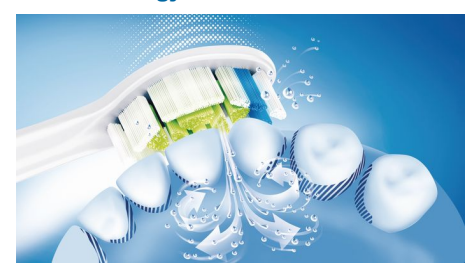
Drives fluid between the teeth and along the gumline for a powerful yet gentle clean.