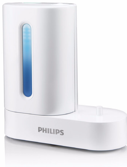
Philips Sonicare UV Brush Head Sanitiser