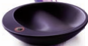
Charger for intimate massager