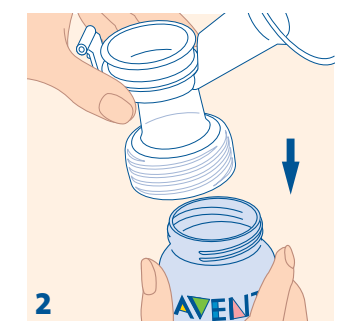
Place the pump body (f) onto the Airflex Feeding Bottle (h).