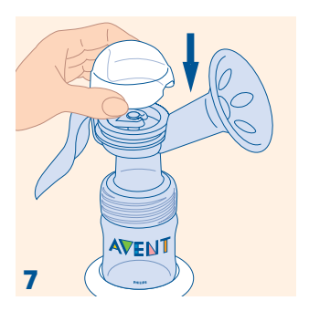
Click the pump cover (c) onto the pump body (f). To make the pump completely stable insert the bottle into the stand (i).