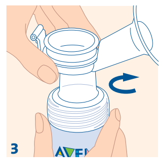
Twist gently clockwise until secure. DO NOT OVERTIGHTEN!