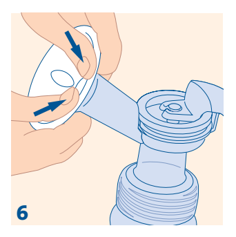
Carefully insert the Let-down Massage Cushion (b) into the pump funnel (f) making sure it is perfectly sealed all round the rim of the funnel. (This is easier if assembled whilst wet.)