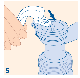
Place the forked end of the handle (e) under the silicone diaphragm and stem (d) and push down gently on the handle until it clicks into place.