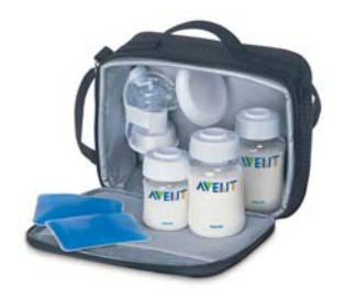
Philips AVENT ISIS Out & About Manual Breast Pump Set – for expressing and transporting breast milk.