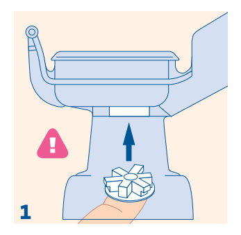
Wash your hands thoroughly. Insert the white valve (g) into the pump body (f) from underneath making sure the flat side of the valve is downwards and the star side is facing up.

Separate all parts and ensure pump has been cleaned and sterilised as in section 3: