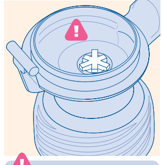
IMPORTANT: DO NOT LOSE THE WHITE VALVE. YOUR PUMP WILL NOT WORK WITHOUT IT OR IF IT IS FITTED INCORRECTLY. If lost, spare valves are available direct from Philips AVENT.