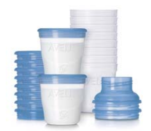
AVENT VIA Breast Milk Storage – for expressed milk storage and transport.