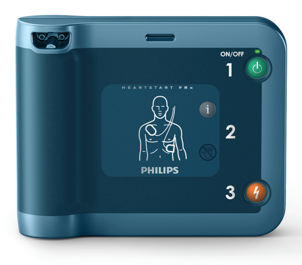
When advised by the device, press the orange Shock button.