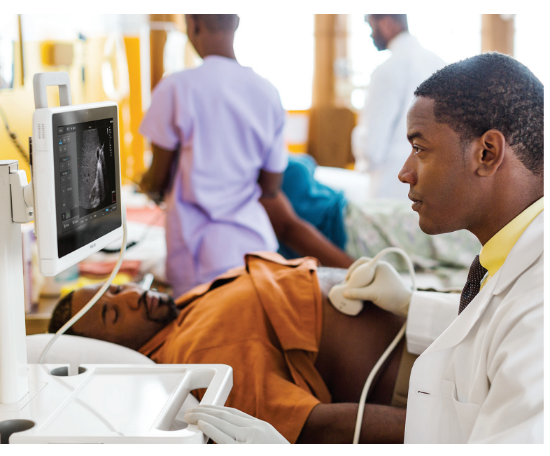
Equally enticing on the cart or off the cart.